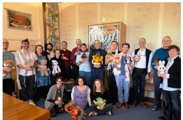
Leo Baeck College day for Children in Need