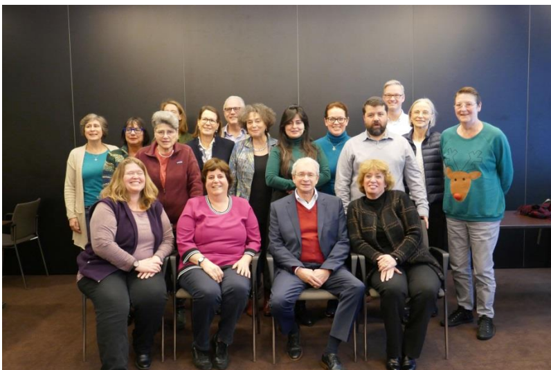
Levisson Group Baal Tefillah

Together with the Board of the Levisson Institute, the Academic Committee and the Vocational Committee, we work to train rabbis, chazzanim, teachers, gabbaim, ba'alei kore, ba'alei tefilla etc. for the continuation of our Progressive Jewish Movement in The Netherlands. Please visit the Levisson Institute on: www.levisson.nl .