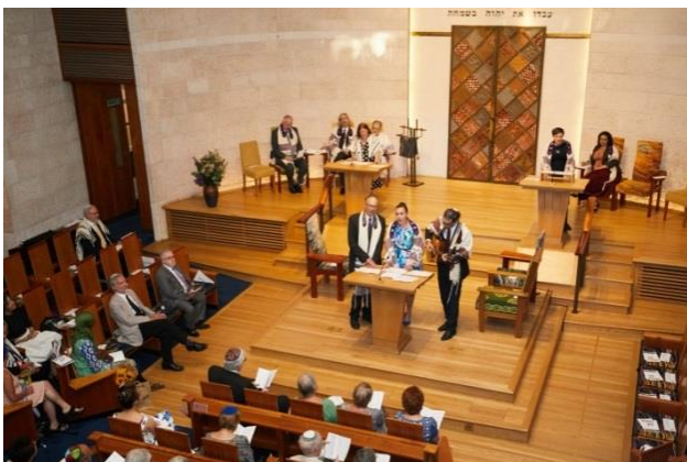
Leo Baeck College Ordination 2018